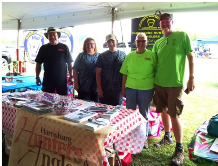
HH&A Table at National Night Out