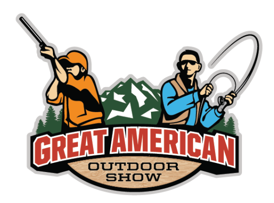
February 4-12, 2023