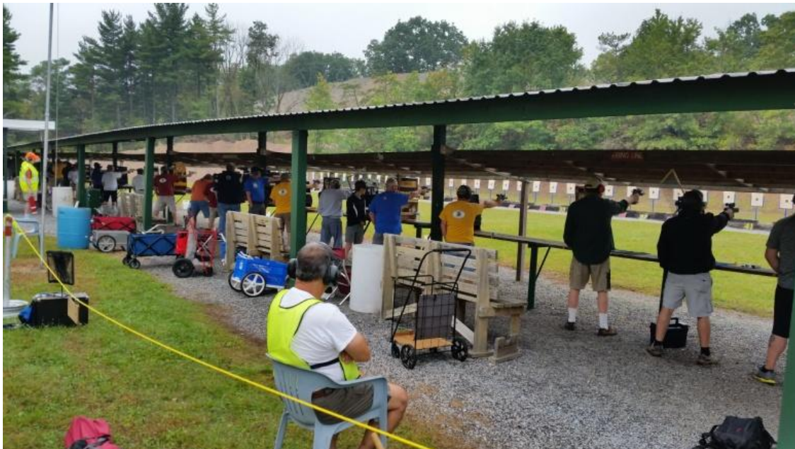
Walter Wise Memorial Police Pistol Match

This year (2022) will be the 63rd anniversary of the Walt Wise match. In its heyday, we had up to 280 shooters registered and ran 4 full relays on Saturday and Sunday to accommodate everyone. Although Bullseye shooting has been in decline in recent years, the Walt Wise match remains one of the largest Bullseye pistol matches on the East Coast. At our last match, we had 110 shooters compete.