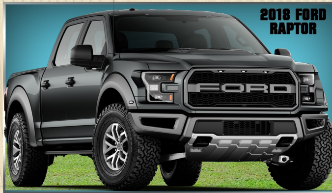
2018 FORD RAPTOR